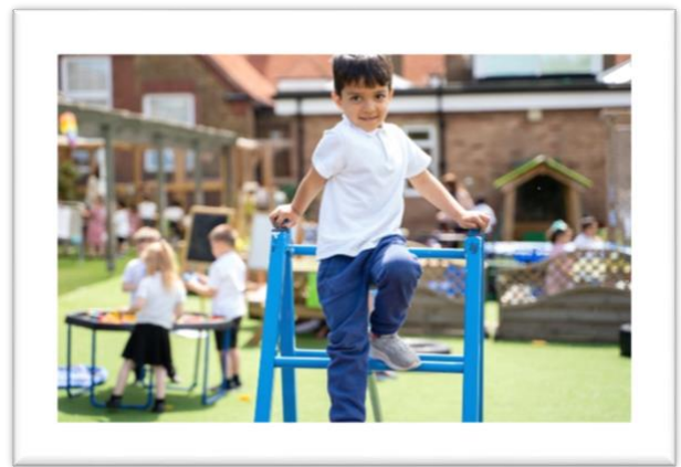
"Playtime at Chesterfield Primary School"