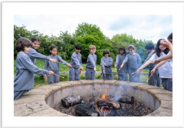
"Toasting marshmallows at Grange Park"