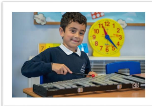
"Playing the xylophone at Carterhatch Junior School"