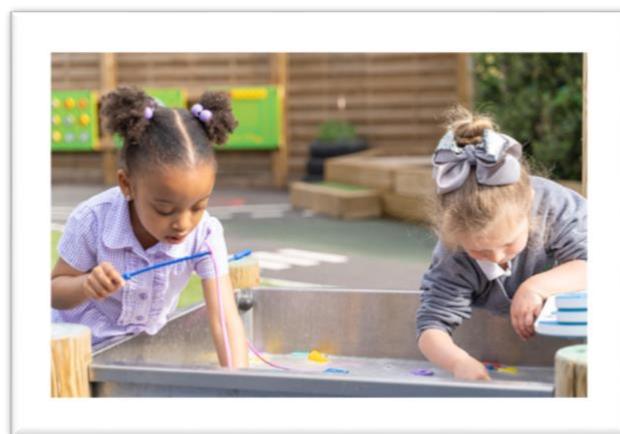
"Playing with my friend at Hazelbury Primary School"

We need to continue to prioritise our children and ensure Connect delivers on our core value of empowering our children to lead Remarkable Futures . As part of our Connect Education Trust strategy we have plans that will move us closer